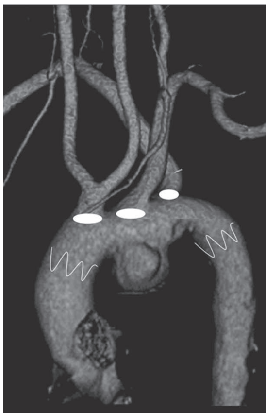
Figure 1 - A complex case.

Aortic arch anatomy can be classified as Type I (all supra-aortic vessels originate at the same level in a straight line), Type II (innominate and left common carotid arteries originate below the left subclavian artery) and Type III (all supra-aortic vessels originate below the straight line, the angle between vessel origin and aortic arch is acute).